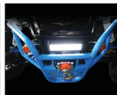
LED AUXILIARY DRIVING LIGHT