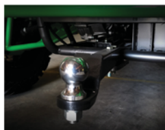
REAR HITCH BALL