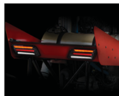
LED TAIL LIGHTS