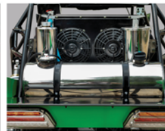
LARGE CAPACITY GAS TANK