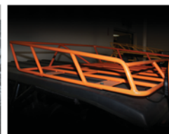
ROOF CARGO RACK