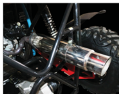
HIGH PERFORMANCE EXHAUST