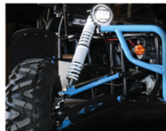
LONG TRAVEL SUSPENSION