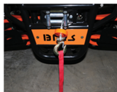
FRONT WINCH 3,000LBS CAPACITY