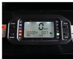
DIGITAL INSTRUMENT CLUSTER