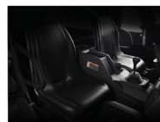
Adjustable Seats Comortable bucket seats