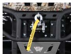
Front Electric Winch 2,500 lbs. Capacity