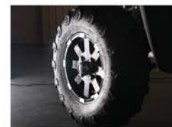
Aluminum Alloy Rims with Kingstone® All-terrain Tyres