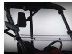
Double Windshield With Ability to remove the lower or upper section