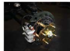
Front & Rear Disc Brake Hydraulic disc brake pump