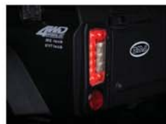
LED Tail Lights Brand New Style Tail lights