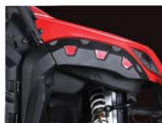
Wheel Fender Flares Front and Rear Wheel Fender Flares