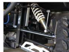
Independent Suspension Front & Rear Independent suspension with double A-arms and brush guards