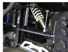
Independent Suspension Front & Rear Independent suspension with double A-arms and brush guards