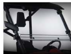
Double Windshield With Ability to remove the lower or upper section