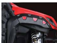
Wheel Fender Flares Front and Rear Wheel Fender Flares