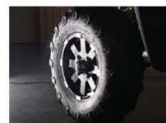
Aluminum Alloy Rims with Kingstone® All-terrain Tyres