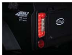
LED Tail Lights Brand New Style Tail lights