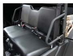
Rear Bench Seat Can fit up to 3 passengers