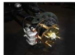
Front & Rear Disc Brake Hydraulic disc brake pump