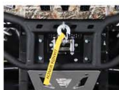
Front Electric Winch 2,500 lbs. Capacity