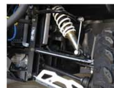
Independent Suspension Front & Rear Independent suspension with double A-arms and brush guards