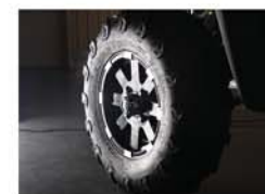
Aluminum Alloy Rims with Kingstone® All-terrain Tyres