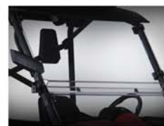
Double Windshield With Ability to remove the lower or upper section