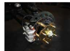
Front & Rear Disc Brake Hydraulic disc brake pump