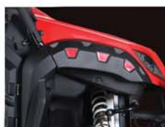
Wheel Fender Flares Front and Rear Wheel Fender Flares