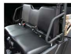
Rear Bench Seat Can fit up to 3 passengers