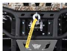
Front Electric Winch 2,500 lbs. Capacity