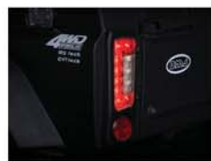
LED Tail Lights Brand New Style Tail lights