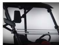
Double Windshield With Ability to remove the lower or upper section