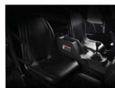
Adjustable Seats with Safety seat Belts