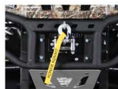
Front Electric Winch 2,500 lbs. Capacity