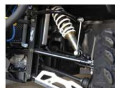
Independent Suspension Front & Rear Independent suspension with double A-arms and brush guards