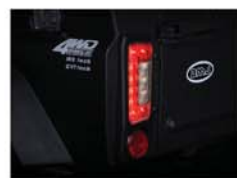
LED Tail Lights Brand New Style Tail lights