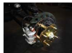
Front & Rear Disc Brake Hydraulic disc brake pump