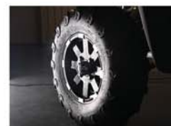
Aluminum Alloy Rims with Kingstone® All-terrain Tyres