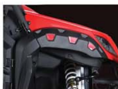
Wheel Fender Flares Front and Rear Wheel Fender Flares